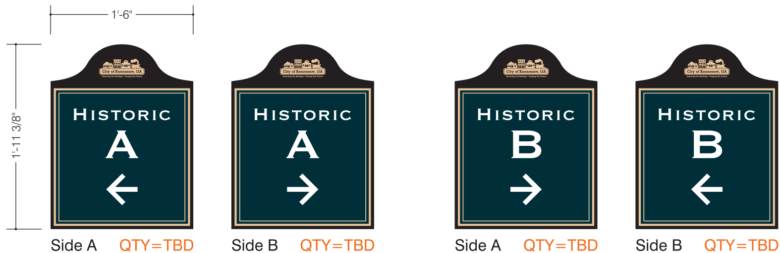
3 SIGN TYPE 09 – ALL FACE PANEL LAYOUTS G2.01a Scale: 1" = 1'-0"