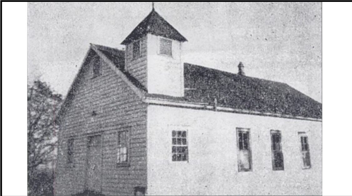
Sardis Church, 1945-1973

In 1932, in the middle of the Great Depression, the original church building burned. The fire was caused by a faulty stove. The church bible, several pews, and an organ were among the items recovered from the fire. Community members helped to build a new structure by donating materials and labor. The nails were salvaged from the previous building and a carpenter offered his services to build the structure for free. It was soon ready for services to be held but the finishing touches would not be completed until 1945. This structure was used until 1973 when the current building was built.